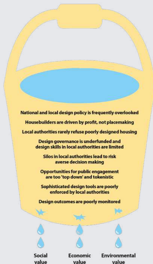
Figure 1. The leaky bucket of design value

There is already a raft of design policy and guidance at both national and local levels in Scotland which shows strong commitment to design dating back to the early 2000s, and Scottish Planning Policy (soon to be merged with NPF4) emphasises the need to consider design at every stage of delivery. We welcome the recognition in NPF4 of housing and neighbourhood design quality as fundamental to addressing the climate emergency and creating places that support people’s long-term health and wellbeing. These issues are also foregrounded in the Housing to 2040 route map. The Scottish Government intends to promote the principle of ‘20 minute neighbourhoods’, encourage community participation through a design standard, roll out demonstrator projects of renewed town centres, as well as raising new build design standards. NPF4 also seeks to focus planning on placemaking and quality issues.