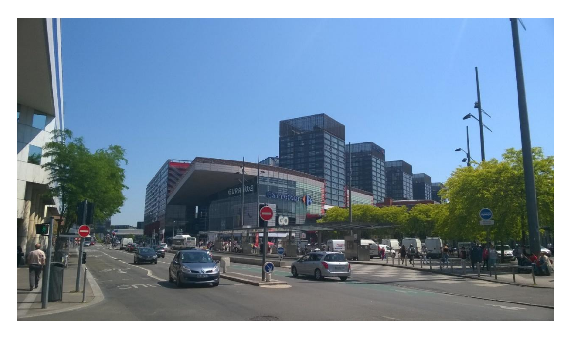
Figure 3: The Euralille office and retail development, located adjacent to the high speed station that lies on the London-Brussels and Paris-Brussels routes.

Prior to being selected to become a métropole d'équilibre , Lille-Roubaix-Tourcoing had been designated in 1966 as one of 14 Communautés Urbaine , or metropolitan authorities, as a solution to the difficulties of governing what was effectively a single contiguous urban region using a proliferation of communes. It has since become a state requirement to cooperate at the intercommunal level, with a number of different models of Établissement Public de Cooperation Intercommunale (EPCI) available. As a metropolitan authority, as opposed to a metropolitan government, the Communauté Urbaine de Lille (CUDL), which in 1996 became the Lille Métropole Communauté Urbaine (LMCU) and in 2014 the Métropole Européenne de Lille (MEL), was not a directly elected body and was governed by an assembly of commune councillors who had been nominated at commune level. The original responsibilities of the CUDL were in public transport, waste management, water, and street and traffic management, though over time its responsibilities became more extensive.