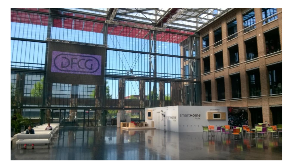
Figure 4: Euratechnologies, one of the series of economic development nodes initiated by the metropolitan authority during the 2000s under the leadership of Martine Aubry.

An additional factor affecting the success of the coalition is that of leadership. While the framework for cooperation, by which we have described the metropolitan authority, was imposed from above, this was not a prescriptive model for cooperation, from which a certain distribution of resources could be arrived at. Consequently, once the coalition was formed its members were left to agree through their own interactions how this might be reached. Game theory posits that for a coalition to form and maintain stability it may sometimes be necessary for it to comprise some strong-willed members whose dominance ensures that other coalition members maintain agreements and coordinate their strategies in order to raise the value of the coalition together in the face of potential disruption.