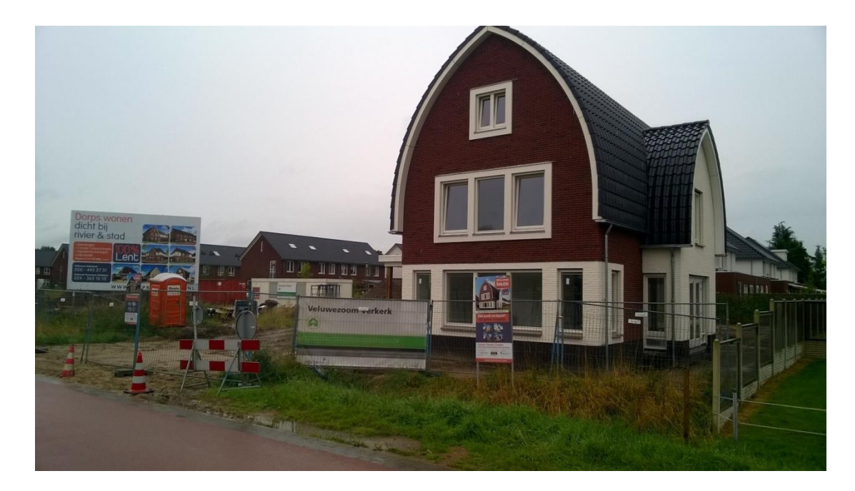
Figure 6: Housing in Waalsprong, Nijmegen. This VINEX location was due to have been completed by 2015 but is presently less than a third complete.

Despite this form of private-public cooperation the long term future of the model was called into question by the 2008 financial crisis. While private developers had sold land to municipalities with an exclusive option to build attached to the sale the option was not compulsorily binding. As a result, municipalities found themselves with ownership of significant quantities of land purchased from developers on the basis of debt finance but over which the associated developers had very little appetite to exercise their option. Municipalities across the Netherlands have found themselves millions – in many cases hundreds of millions – of Euros in debt since the beginning of the crisis, wiping out value captured from development built up over the preceding two decades and in some cases pushing them close to bankruptcy (Kuijer interview, 2015).