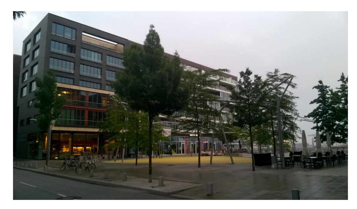
Figure 2: generous provision is made for public space in the City State-authored plans.

HafenCity Hamburg GmbH is operationally independent of its owner, Hamburg City State, and is formally responsible for the development of HafenCity, acting as the partner for private sector investors and developers as well as state and third sector agencies, while being the trustee of the City and Port special fund. The City State's role, in addition to its capacity as funder, is to use legislative and policy measures to enable HafenCity Hamburg GmbH to function effectively. A state commission within the City State is responsible for the approval of development plans, urban design guidelines, and building permits.