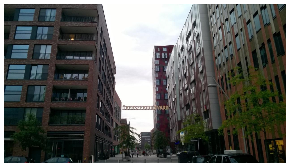
Figure 1: HafenCity's urban layout is almost entirely built out from scratch.

Resulting in part from Hamburg's shortage of housing and the city-state's decision to only situate new housing development on brownfield sites inside its boundaries, the HafenCity concept was presented by the city in 1997 as an entirely new district of Hamburg that would expand the existing city centre area by 157 hectares (HafenCity Hamburg GmbH, 2015).