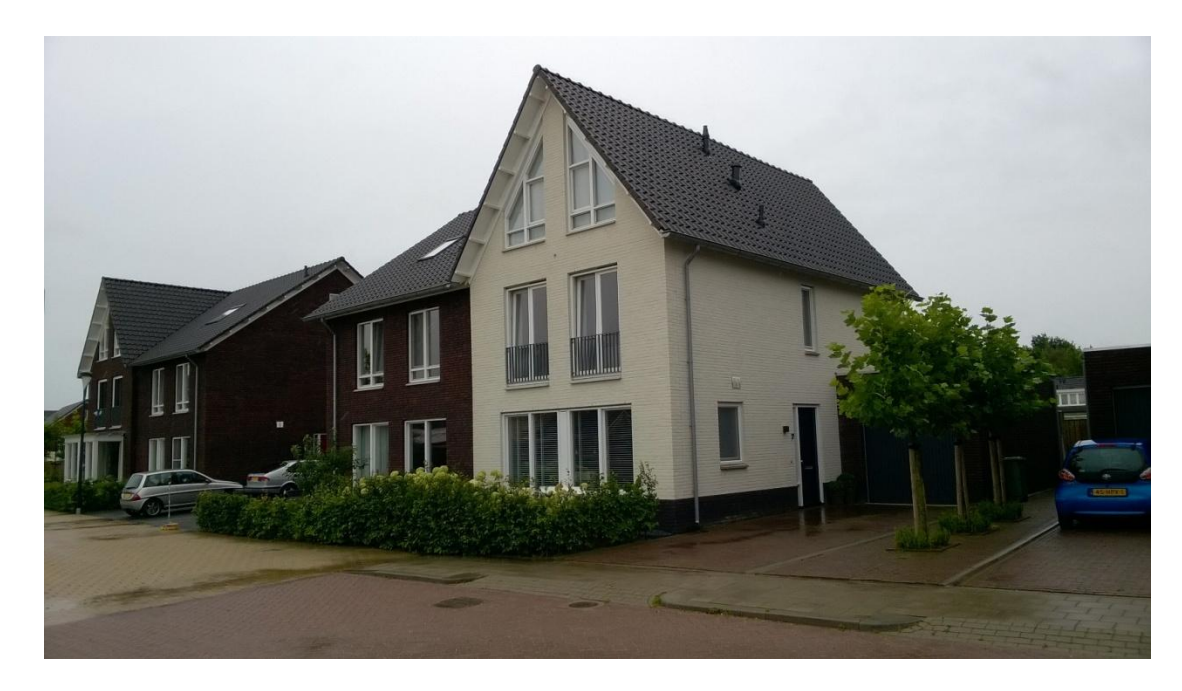
Figure 5: typical VINEX housing in Waalsprong, Nijmegen.

During the VINEX programme the public land development model ran into difficulties. While the basis of the model lay in the ability of municipalities to purchase land at the rural-urban fringe at close to agricultural prices the announcement of the VINEX locations prior to the public purchase of land allowed private developers to step in and buy land ahead of the municipalities, confident that planning permission would be granted for these sites subsequently. While it might be expected that developers would use their position to either fully develop the land without state involvement or to sell the land to the municipalities at an inflated value, however, interviewees suggest that, so accustomed had developers become to the state acting as the first mover that in many cases they were buying land in areas where consent was to be given simply to obtain the right to develop. Research shows that what would have been speculative land acquisition under other planning systems was not always capitalised on by Dutch developers. Priemus and Louw (2000) (referenced in Priemus and Louw, 2003) note that in many instances developers either bought land in cooperation with a local authority or sold their land to a local authority at a loss, providing that an exclusive option to build was granted.