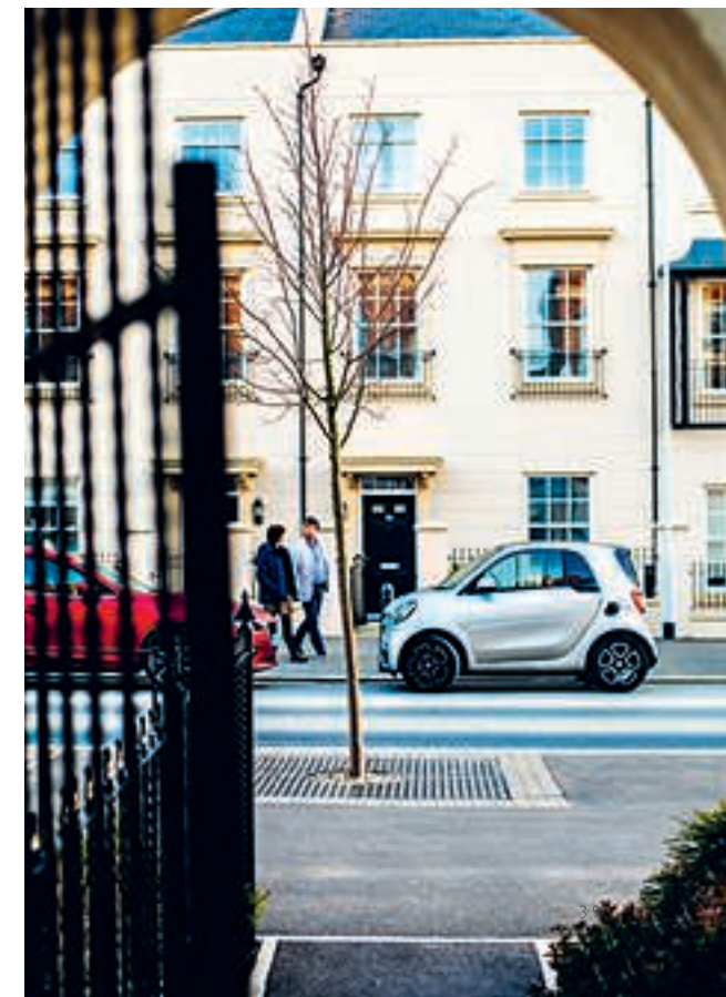
Left to right: The site at Sherford in Devon; some of the finished houses on the estate