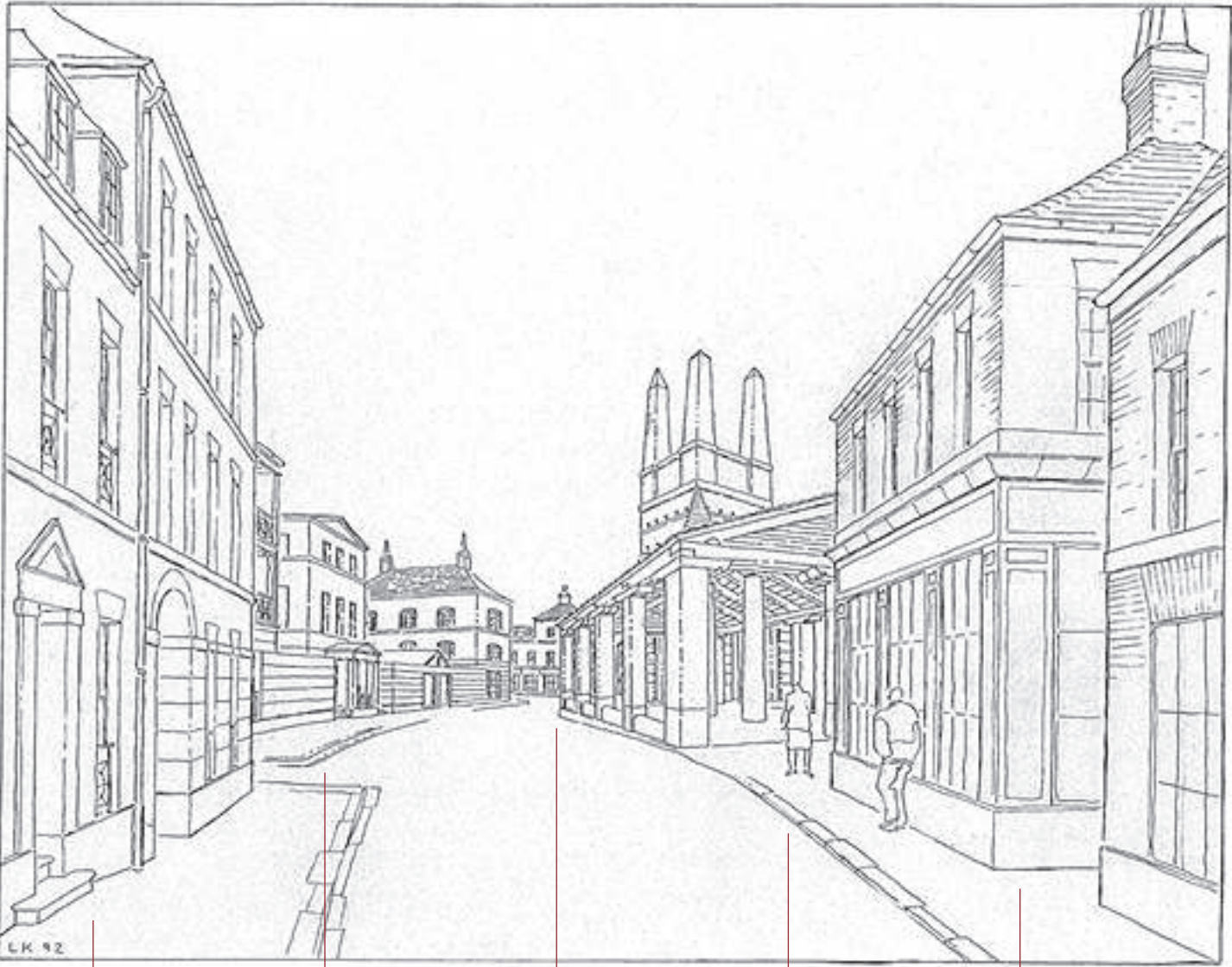
Drawing of Poundbury by Léon Krier, 1992

TRANSPORT ENGINEERING IS CRUCIAL TO HOW NEW URBAN PLANNING CAN WELCOME PEDESTRIANS BEFORE CARS