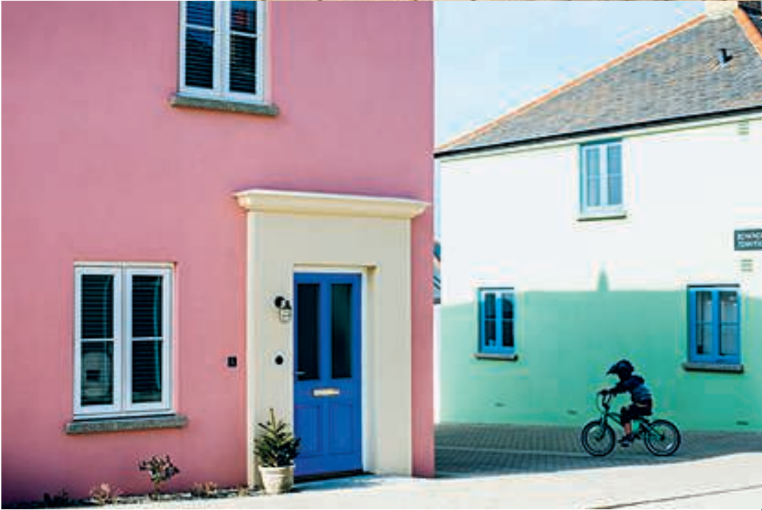
Clockwise from top left: One of the local children plays outside; detail of a drywall and slate street sign in Tregunnel Hill; a builder finishes tiling on one the roofs; bold colour is used throughout Nansledan

It is a mutually beneficial relationship between smaller developers and landowners who prioritise placemaking. James warns though that one of the housing industry’s biggest threats to the delivery of quality housing is a growing skills shortage. “Building more homes in the UK can be done through the medium-sized homebuilders, but there is a massive skills shortage to deliver them,” he warns. This too is an area where The Prince’s Foundation offers support via its range of training courses in traditional crafts and building skills. Through education, and by opening up the market to smaller developers by making land accessible and affordable, the house market can truly diversify.