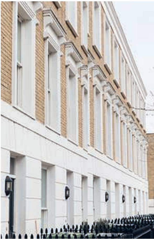
Clockwise from right: A row of new social houses in Union Square on the Packington Estate, the design of which complements the neighbouring Victorian houses; one of the local residents; a view of the Estate from Regents Canal