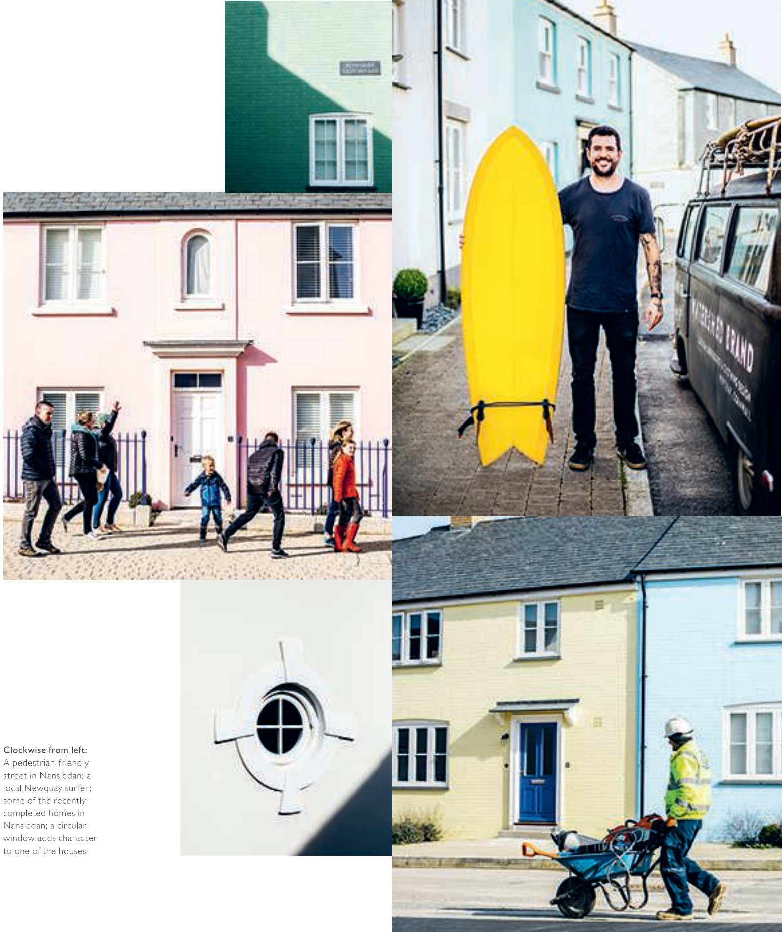
Clockwise from left: A pedestrian-friendly street in Nansledan; a local Newquay surfer; some of the recently completed homes in Nansledan; a circular window adds character to one of the houses

CG Fry’s story though takes place against a backdrop of consolidation. Today, housing is mainly delivered by a system where the company that builds the cheapest gets to build the most. The buying power of the volume housebuilders means they can build at low cost and offer more money for land up front, effectively reducing the opportunities for those