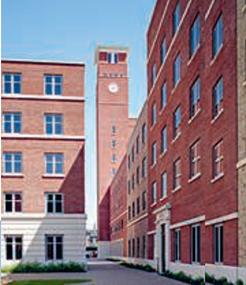
From left: The new Coed Darcy town in Wales built on the site of the Llandarcy oil refinery; Swansea University's award-winning Bay Campus

Any journey to the Welsh city of Swansea at the end of the last century took drivers on a route past the hulking carcass of BP's Llandarcy oil refinery – a vast industrial site that at one point was one of the region's largest employers. After 60 years of production, BP started shutting down operations in the 1980s, leaving behind what was labelled as one of the most polluted sites in Europe.