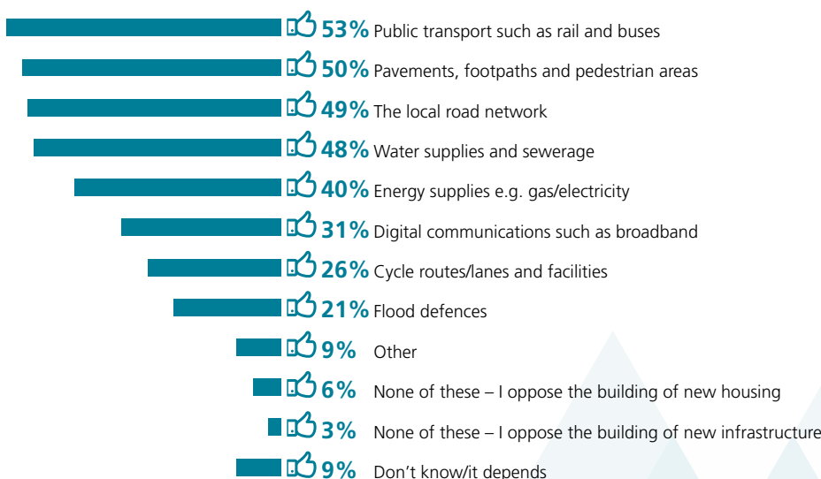
Figure 2: Which, if any, of the following types of new infrastructure should be given highest priority when planning the building of new housing in your local area in the future?

Source: Ipsos MORI Base: 2,148 GB adults 18–75, 23–27 August 2019